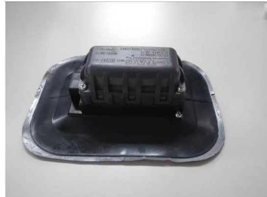
A sensor and a patch of B-TAG